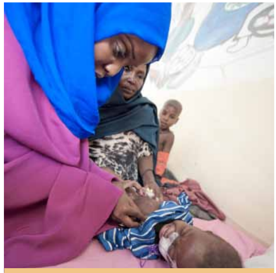
A nurse examines one of the children admitted at the Baidoa Regional Hospital Stabilization Centre.

According to international organizations, over 300,000 children in Somalia are malnourished, of whom more than 58,000 are acutely malnourished and in critical need of therapeutic feeding and medical treatment. The two centres mentioned, though insufficient on their own, provide a critical venue for this vital care in the South and Central region of Somalia.