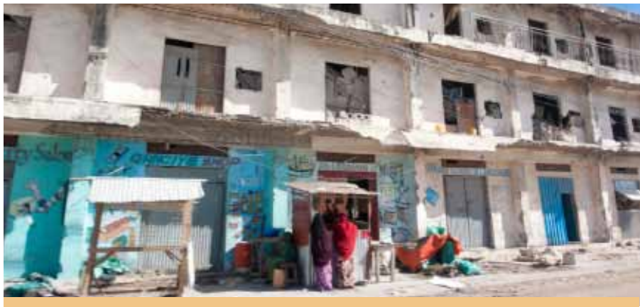
A building in Somalia that has been destroyed by years of conflict.

Somalia has been ravaged by decades of armed conflict which has disrupted livelihoods and thrown the social fabric into disarray. Seasonal occurrences of drought and floods deepen the crisis by creating an acute food shortage in parts of the country. Children, especially those under five, are susceptible to the resulting inadequate diet and associated diseases; left unchecked, such malnutrition can be fatal.