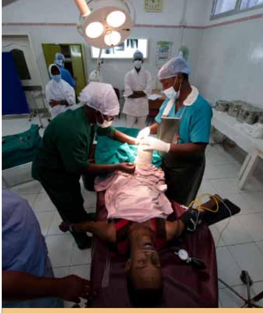
A weapon-wounded victim undergoing surgery at Keysaney Hospital

in the hospital even though security in Mogadishu remains a challenge. We are here to provide medical aid to those in need regardless of their affiliations. This position has enabled us to remain operational given the challenging environment we work in. Keysaney has survived this long and everyone knows the hospital belongs to the Somali community and is for those in need of medical attention.