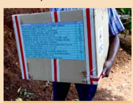
A dressing kit package

Fifty dressing kits were provided to hospitals and clinics by the ICRC in 2014