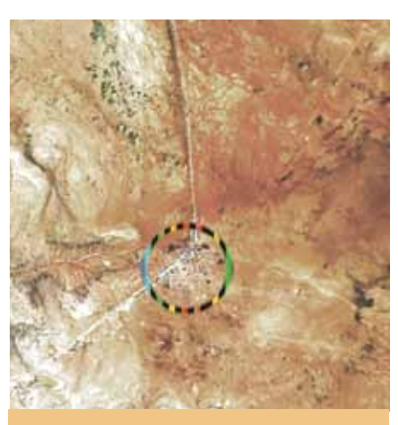
Satellite image of the remote Dangoroyo area located in the northern part of Somalia

The Dangoroyo area serves as one example. Located approximately 100 kilometers north of Garoowe town in Nugaal region in the horn of the country, it is home to around 16 villages scattered over the rural expanse. The residents are mostly pastoralists who earn a modest living from selling their animals.