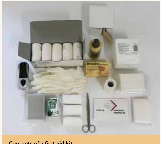
Contents of a first aid kit

First-aid kit- This is a small bag containing basic dressing material to be used on a newly injured person to stop bleeding and cover wounds. They can be used at the scene of an accident or in the home. A standard first aid kit could treat up to ten people depending on how severe the injuries are. It is used to provide temporary relief until further medical attention is found.