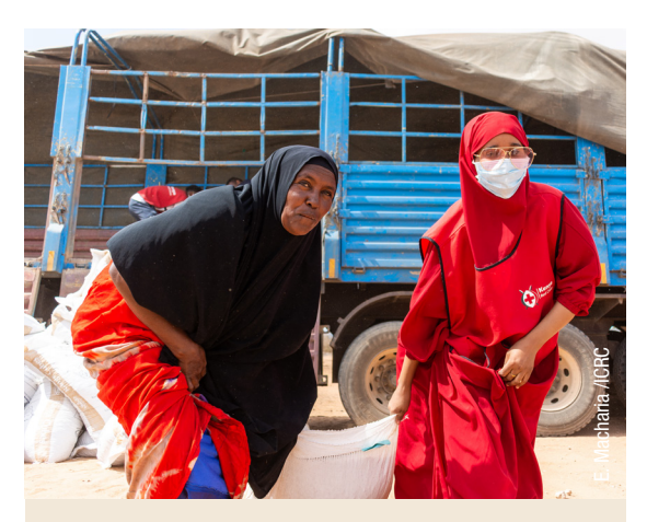
Red Cross volunteer extends a helping hand to a beneficiary during the distribution in Mbalambala, Garissa county. All humanitarian activities taking place in the affected regions rely on the welltrained and motivated local volunteers of the KRCS.