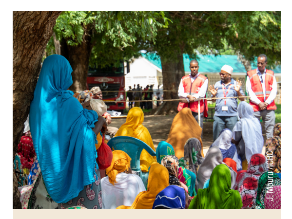
Information session with residents in Lamu county. Engagement with affected communities allows Red Cross teams to better understand humanitarian needs and determine potential priorities for response, but also to raise awareness about the Red Cross principles and activities.