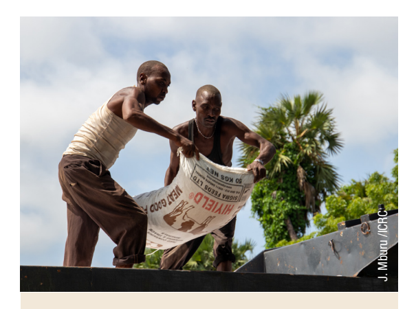
Distribution of livestock feed in Lamu county. Aid deliveries in the pastoralist areas severely hit by the drought contain high-protein range cubes to meet nutritional needs of livestock.