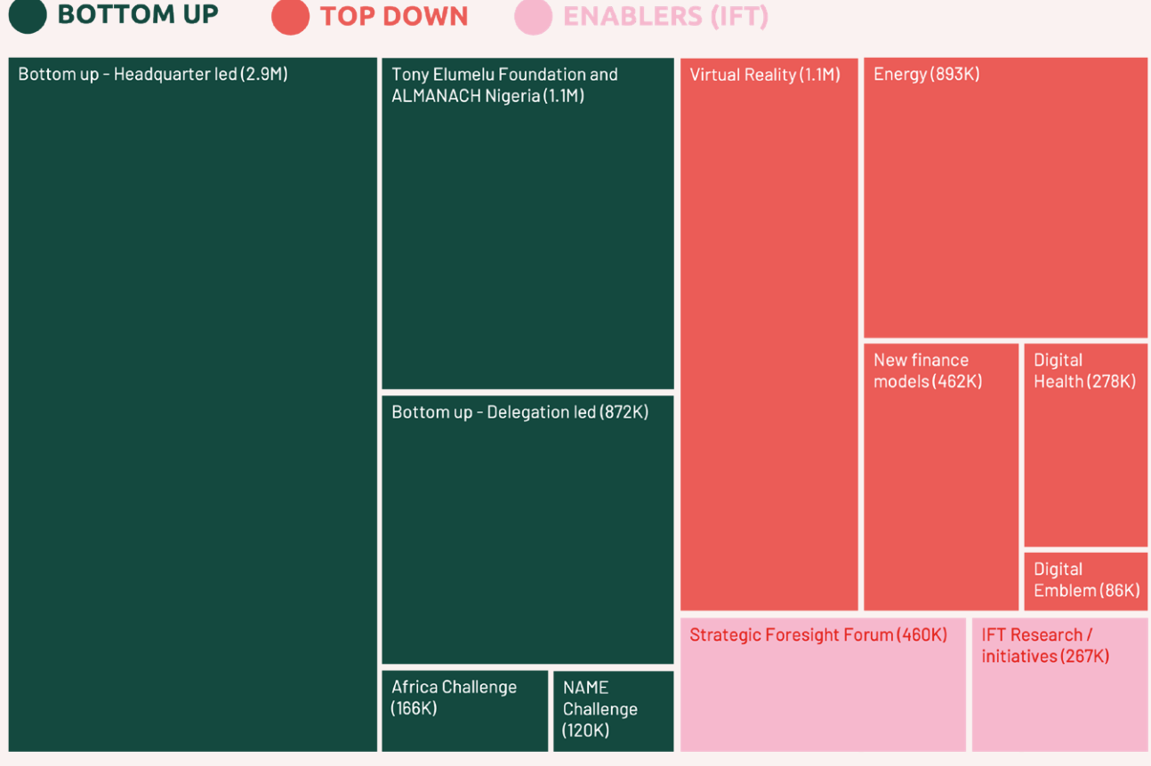
Figure 1. Total IFT investments (8.7M CHF) from 2018 to June 2023. Investments include 86 closed and 7 ongoing initiatives with available data. Excludes other IFT activities such as communications, InspiRED days, and other training and facilitation.