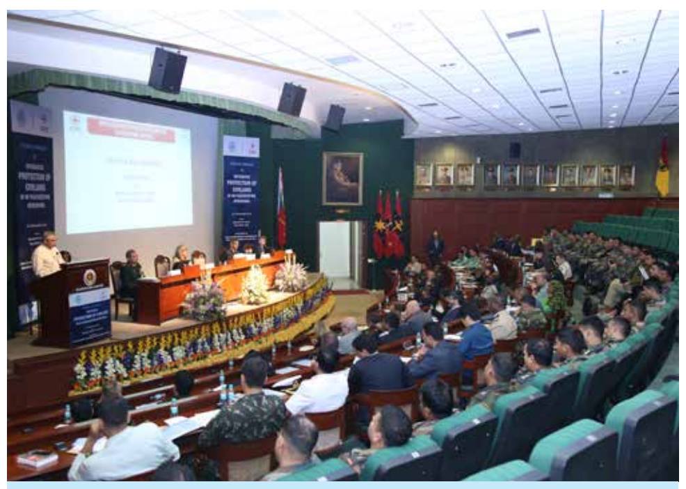
A glimpse of the inaugural session in progress