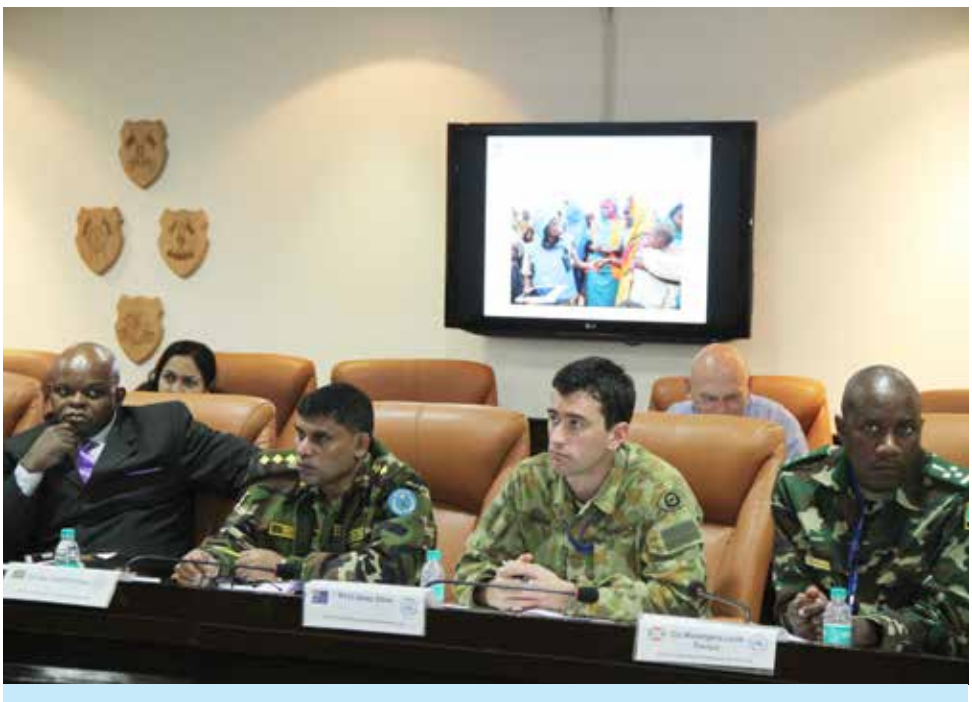
Some officers listening to a presentation at the workshop