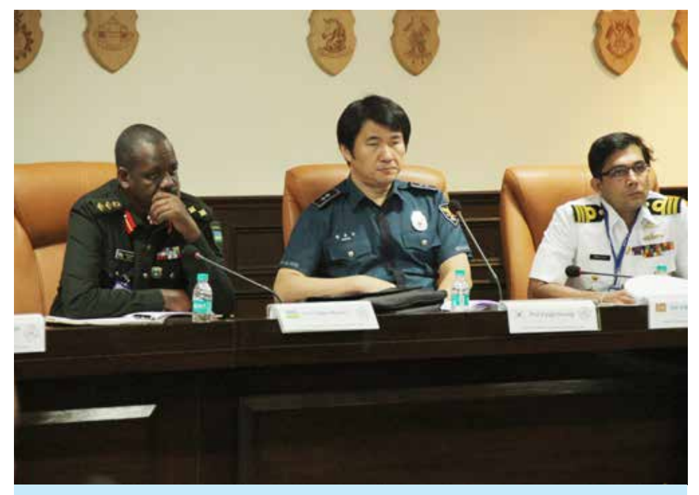
Workshop participants listening to a presentation