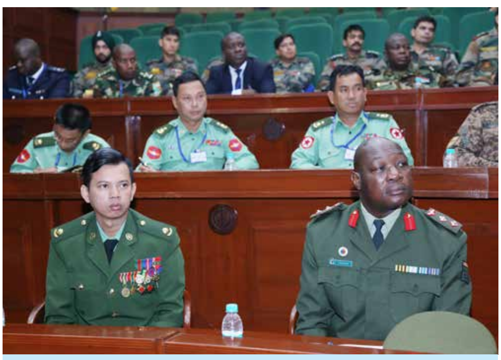
Officers listening to one of the presentations during the inaugural session