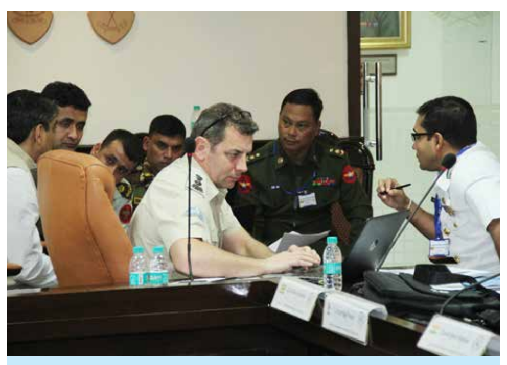
One of the Syndicates preparing a solution for one of the group exercises