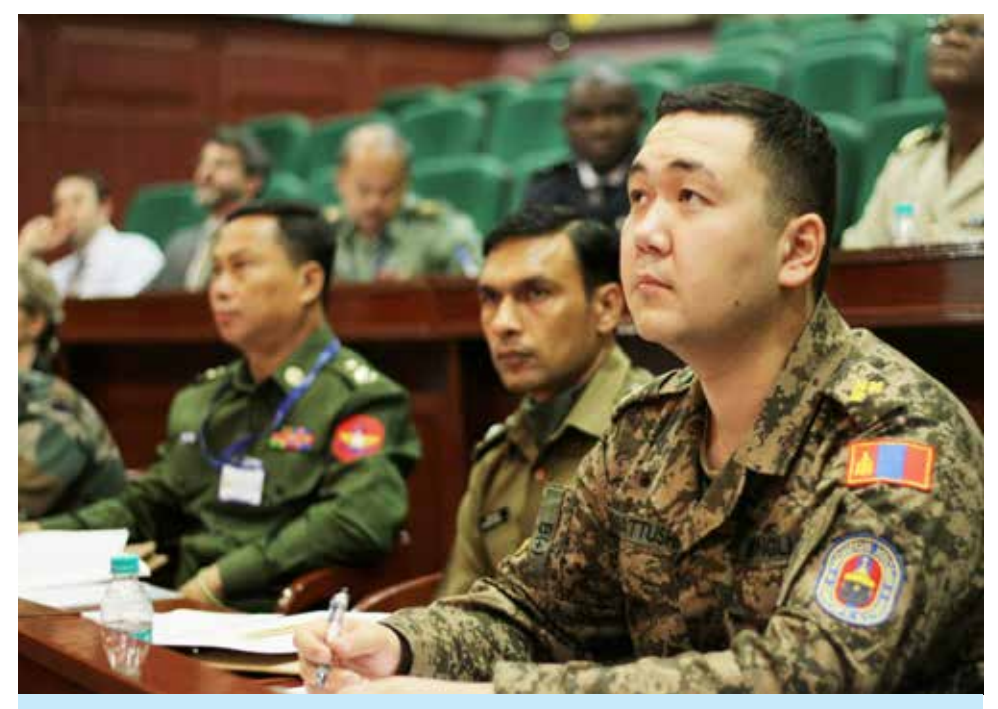
Participants involved in one of the sessions