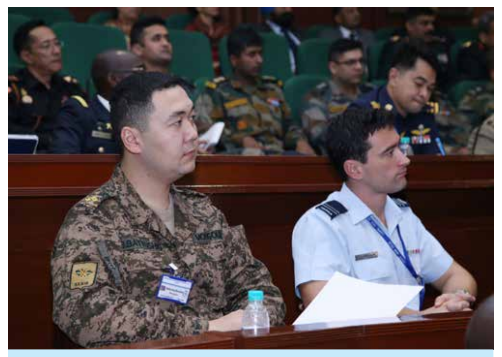
Officers listening to one of the presentations during the inaugural session