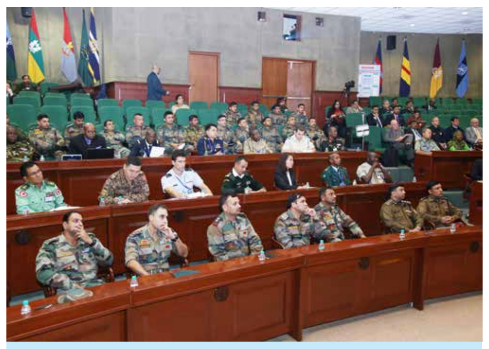
The workshop was attended by serving as well as retired military officers and government representatives from over 30 countries