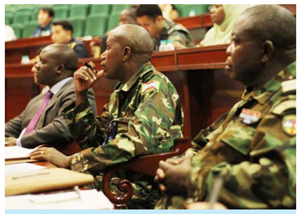
African participants at the workshop