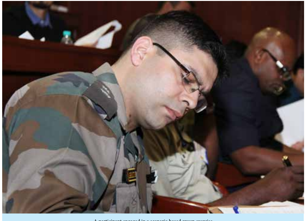
A participant engaged in a scenario based group exercise