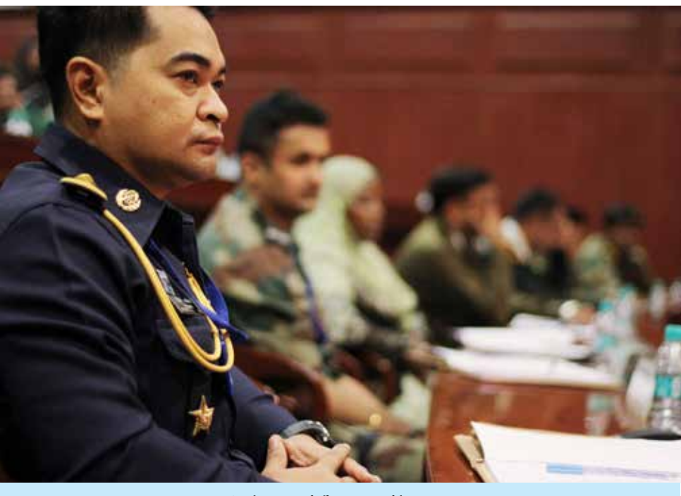
Another group of officers in one of the sessions