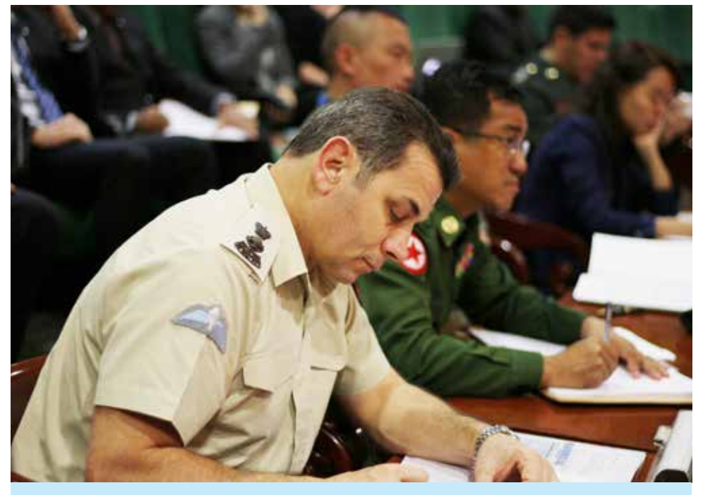
Participants taking notes during presentations