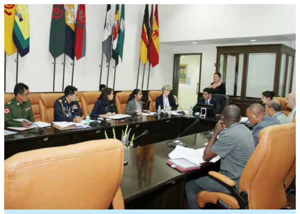
A group preparing a solution for one of the scenarios