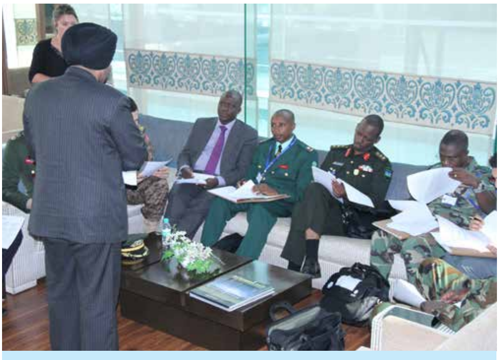
Another group of participants engaged in a scenario based exercise