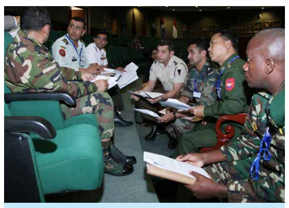
Participants engaged in a scenario based group exercise