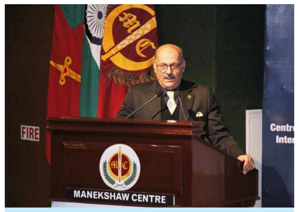
Lt Gen Sanjiv Langer, PVSM, AVSM giving a presentation on UN's strategic perspective on the protection of civilians