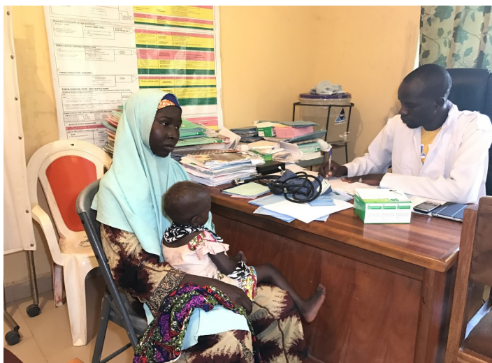
A health worker consults in a Primary Health Care facility supported by the ICRC in Yola, Adamawa State.

Over 19,500 children were delivered in ICRC supported clinics;