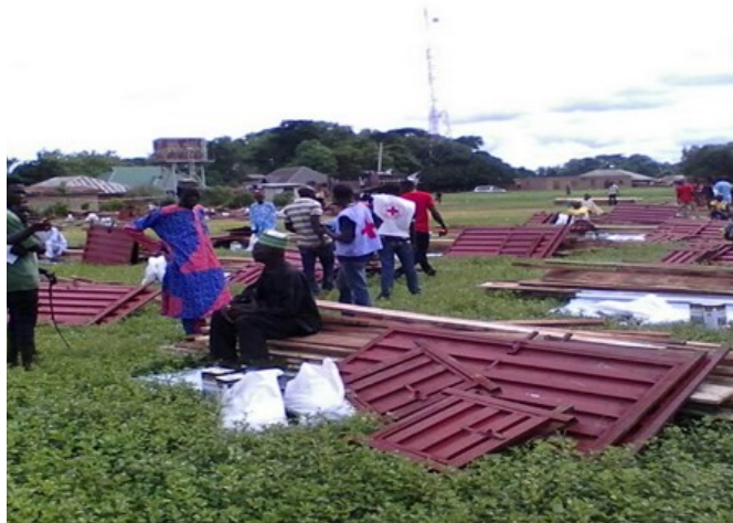
The ICRC and NRCS provided building materials to rebuild over 500 homes destroyed by communal violence in Agatu, Benue State.

To promote hygiene in the camps, the ICRC works with the NRCS and displaced persons on cleaning the environment. In areas where returns are possible, the ICRC has stepped up its work to repair or construct water systems benefitting both host communities and returnees.