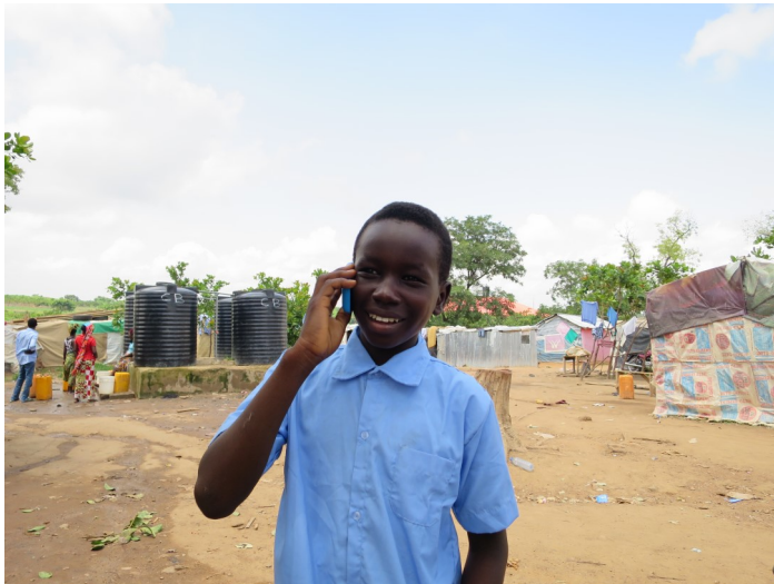
A child in one of the camps for the displaced, after 3 years, was able to speak with his mother using the free phone call services.

6,640 new tracing requests were opened by persons looking for relatives with the ICRC or the NRCS;