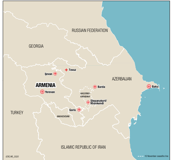
ICRC/ARL_2020 ⊕ ICRC delegation ⊕ ICRC sub-delegation ⊕ ICRC mission ⊕ ICRC presence

The boundaries, names and designations used in this document do not imply official endorsement or express a political opinion on the part of the ICRC, and are without prejudice to claims of sovereignty over the territories mentioned.