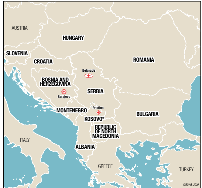
ICRC regional delegation ICRC delegation ICRC mission *UN Security Council Resolution 1244

The boundaries, names and designations used in this document do not imply official endorsement or express a political opinion on the part of the ICRC, and are without prejudice to claims of sovereignty over the territories mentioned.