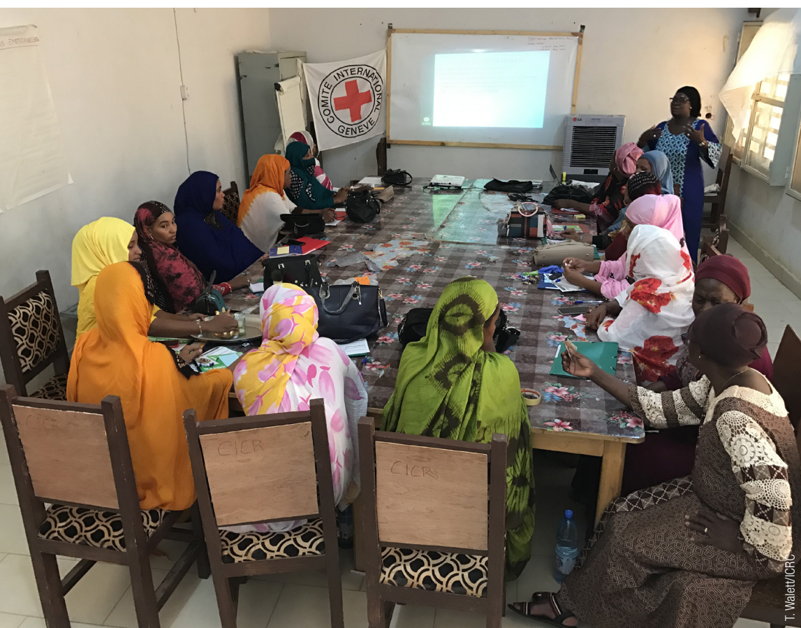
Mali, Kidal. The ICRC organized a training for health workers on assisting victims/survivors of sexual violence.