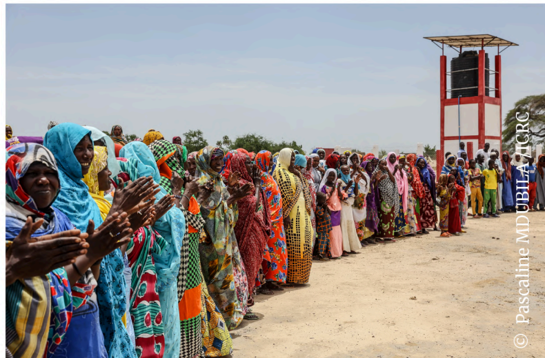
Women saying prayers of thanks near the drinking water access infrastructures built by the ICRC in Dougmo1 in the Makary District – Far North Region.