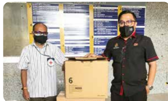
Delivery of assistance items to the Immigration Department Headquarters.