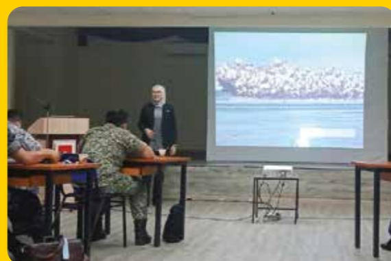
Armed and security forces team gave a talk to officers from the Malaysian Armed Forces, Malaysian Police and the Malaysian Maritime Enforcement Agency.