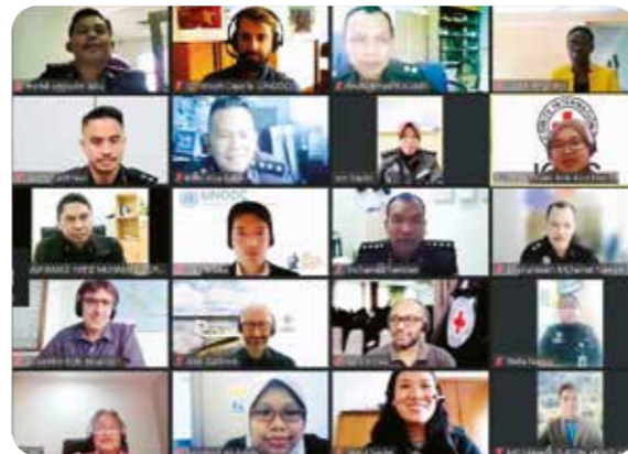
Launch of Training for Trainers courses based on UNODC's eLearning course on the Nelson Mandela Rules. ICRC Kuala Lumpur Regional Delegation also helped with the Bahasa Malaysia translations of these rules.