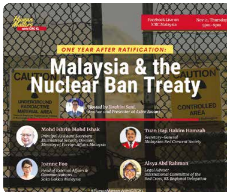
The third installation of the delegation's Facebook Live Talk series in conjunction with one year post ratification of the Treaty on the Prohibition of Nuclear Weapons.

Our experts were also invited to explain our role and mandate to an international audience of military officers during the MAF Staff College Command and Staff Course 50/2021 in November. In December, we organised a two-day workshop for the Royal Malaysian Police , exploring the humanitarian consequences associated with the practice of law enforcement powers, in particular the use of force and firearms, search and seizure and the arrest and detention of individuals.