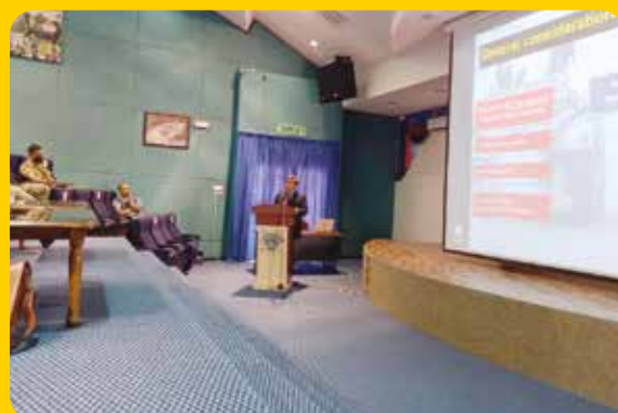
The International Monitoring Team to Mindanao at the Malaysian Peacekeeping Centre attends a talk on IHL.