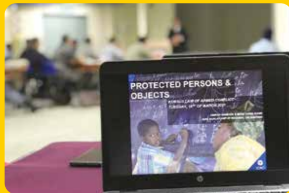
A talk on IHL under way during a course on Law of Armed Conflict.

To raise awareness on IHL, encourage its compliance and contribute to its development, our teams conducted talks, training sessions, academic lectures and facilitated workshops for militaries, law enforcement agencies, academia and key government agencies and officials. We also engaged with civil society actors, students and the general public through awareness campaigns and other events to foster an environment conducive for the respect for life and dignity, and to gain support for our work.