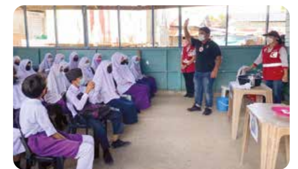
Session on Health & Hygiene for 100 children at the Alternative Learning Centre.

*The CHV initiative is a flagship programme jointly implemented by the ICRC, MRCS and the Sabah Health Department whereby volunteers are trained on how to identify health-related problems in their settlement (ie. polio, measles & COVID-19) and are capable of responding promptly by alerting the district health authorities in the event of an outbreak.