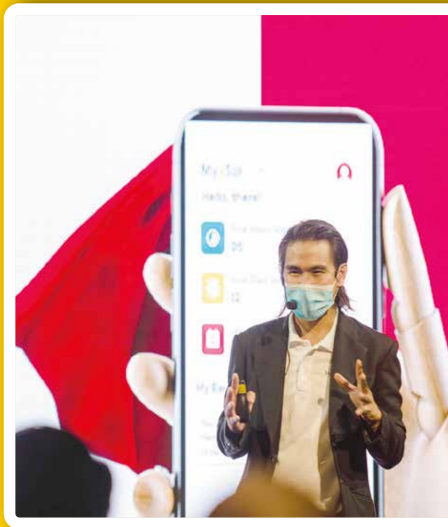
Launch of the MySukarela app – a digital application that serves as a one-stop centre for volunteers. The ICRC supported the initiative alongside the Asia Foundation.