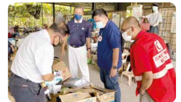
The ICRC Kuala Lumpur's Kota Kinabalu's office pays a visit to Tzu Chi's Kolombong Recycling Centre in Sabah.