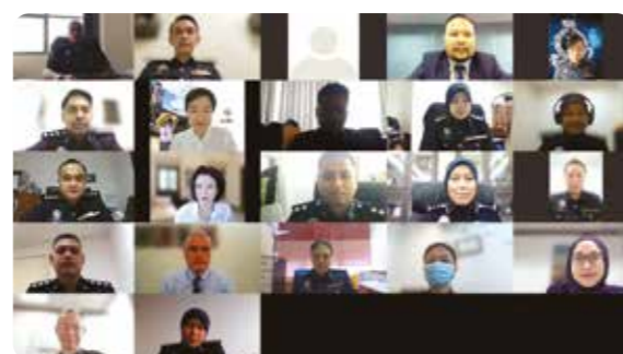
Workshop held for the Royal Malaysian Police where topics ranging from policing standards, international humanitarian rights law, detention, sexual violence, migration and the use of firearms were covered.

We also ran a series of online campaigns promoting information on the Nelson Mandela Rules, Geneva Conventions, the ICRC's policy on the protection of children, issues related to missing migrants, mental health, and IHL, terrorism and counterterrorism, to name a few.