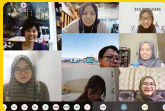
Students pursuing Moral Education at University of Malaya attend an IHL workshop.