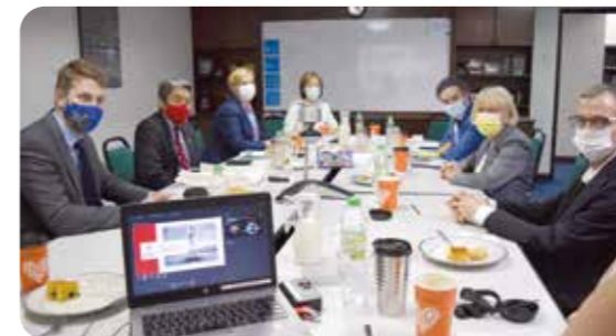
Teams from Nordic and Swiss embassies in Malaysia on a visit to the ICRC Kuala Lumpur headquarters.