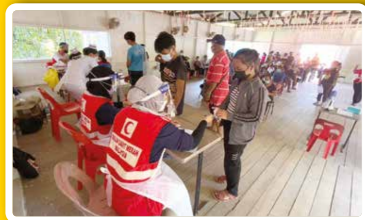
The ICRC participated in a COVID-19 vaccination outreach programme by the District Health Office in Nabawan, Sabah for general monitoring.

The ICRC has been active in Sabah since 2013, working alongside the Malaysian Red Crescent Society (MRCS) to run health and hygiene, and community programmes for remote and marginalised communities, with the support of the state's security and health authorities.