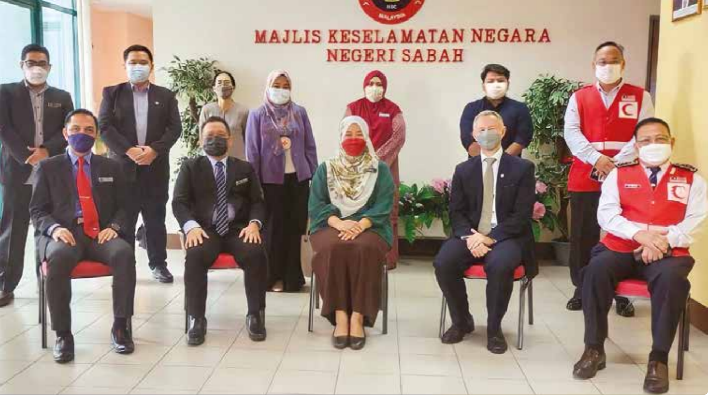
The Deputy Head of Regional Delegation in Kuala Lumpur Martin DeBoer (second from front right) meets with the National Security Council of Sabah.