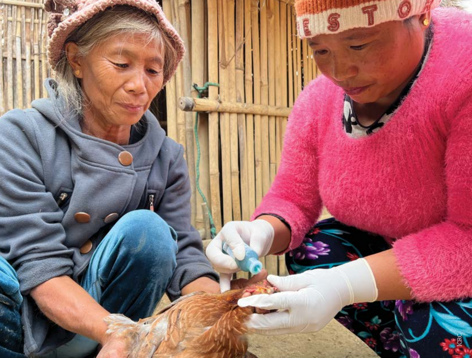
A community animal health worker, trained by the LBVD department in Kachin with the ICRC's support, vaccinates the chicken of a family from San Lun Yang resettlement in Mansi Township.