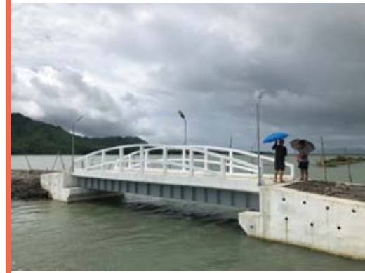
3 new bridges in Pauktaw Township eased daily commutes for some 13,000 people.